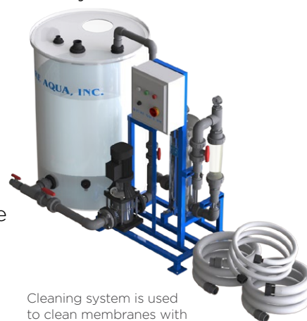
Cleaning system is used to clean membranes with Pure Aqua's PAClean-LPH and PAClean-HPH

PAClean-LPH is a mildly-acidic RO membrane cleaner for removing fouling caused by iron salts, oxides and hydroxides. It can also be used to remove calcium carbonate scaling.