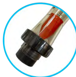
2" Male Connection