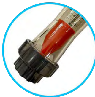
2" Female Connection